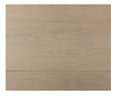
CREAM 6477 finished with: 2 Coats FORTICO 1C SATIN 7577