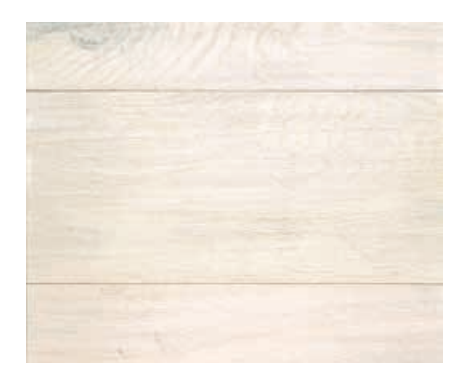
WHITE 6363 finished with: 2 Coats OCULTO 7211