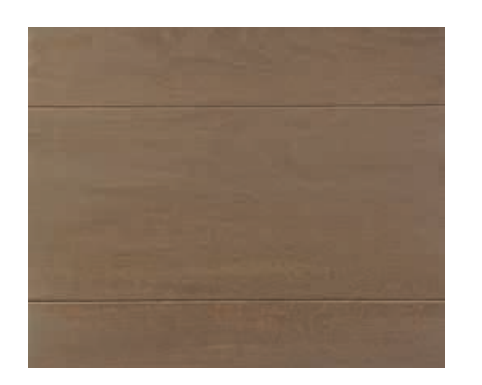
MOCHA 6476 finished with: 2 Coats FORTICO 1C SATIN 7577