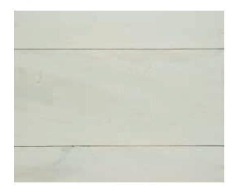
GINGER 6474 finished with: 2 Coats OCULTO 7211