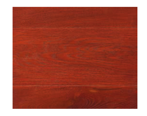
CHERRY 6468 finished with: 2 Coats FORTICO 1C SATIN 7577