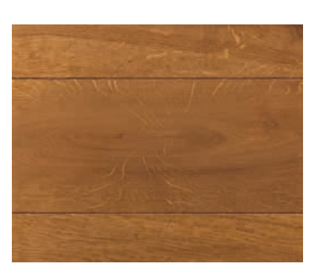
MID OAK 6467 finished with: 2 Coats FORTICO 1C SATIN 7577