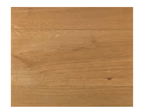
LIGHT OAK 6466 finished with: 2 Coats FORTICO 1C SATIN 7577