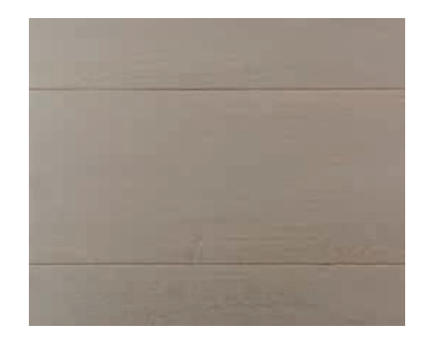
LIGHT GREY 6657 finished with: 2 Coats OCULTO 7211