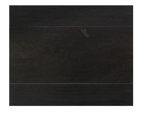
BLACK 6464 finished with: 2 Coats FORTICO 1C SATIN 7577