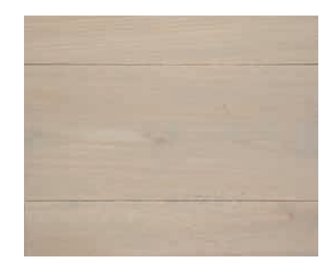
ALMOND 6478 finished with: 2 Coats OCULTO 7211