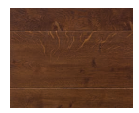
WALNUT 6469 finished with: 2 Coats FORTICO 1C SATIN 7577