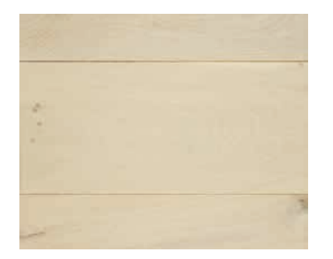
VANILLA 6472 finished with: 2 Coats OCULTO 7211